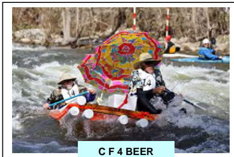
C F 4 BEER