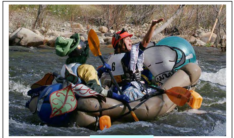
MAD TEA PARTY

If you are up to the Challenge, get your group together and start building a boat. Can be for a single person or a group of people. Will have to navigate the boat from the bottom of Ewings Rapid (not through the rapid) to the bottom of Riverside Park. Sounds Simple!?!? Well, not really.